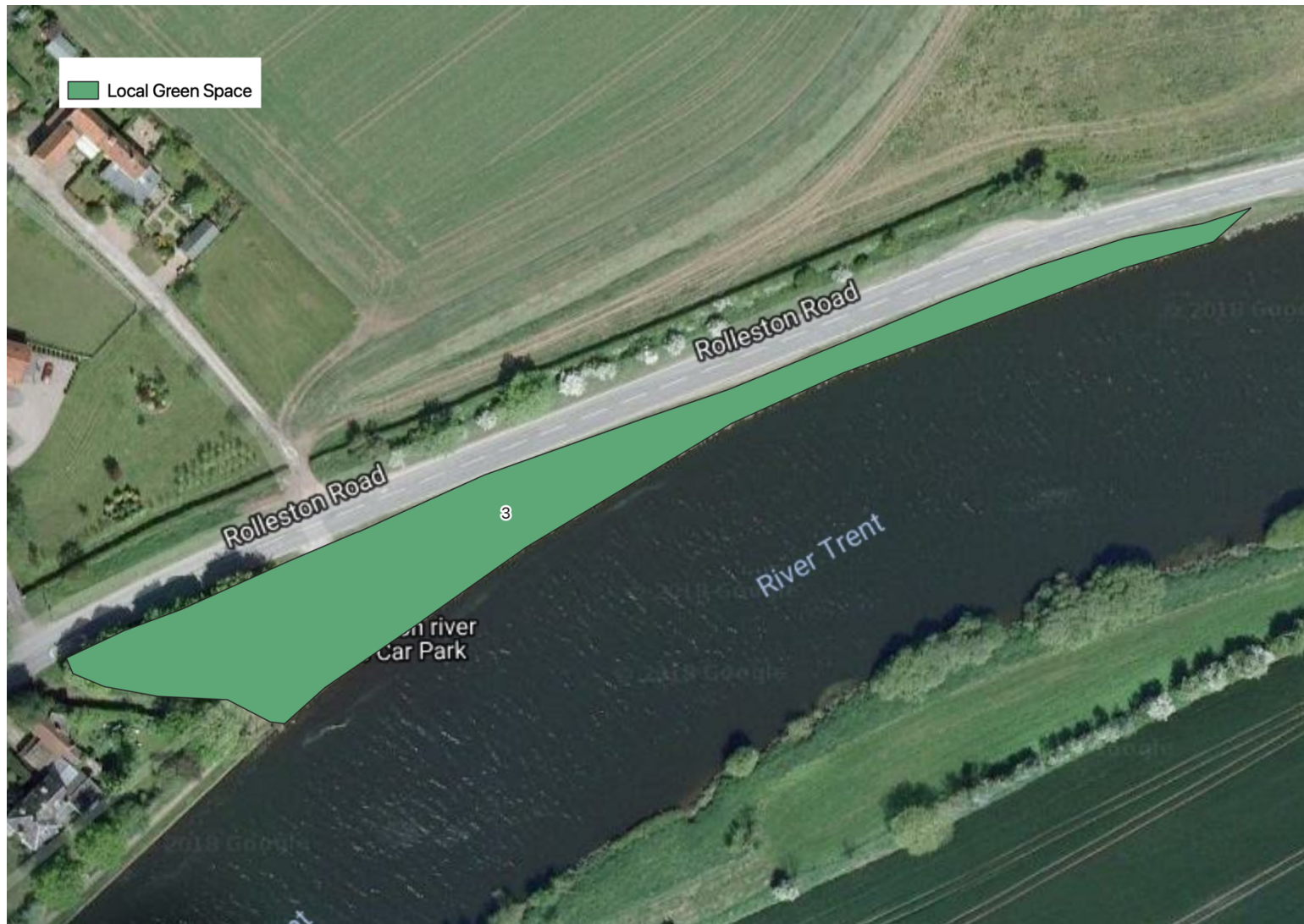
Figure 9 Riverside Carpark and Picnic Area Map