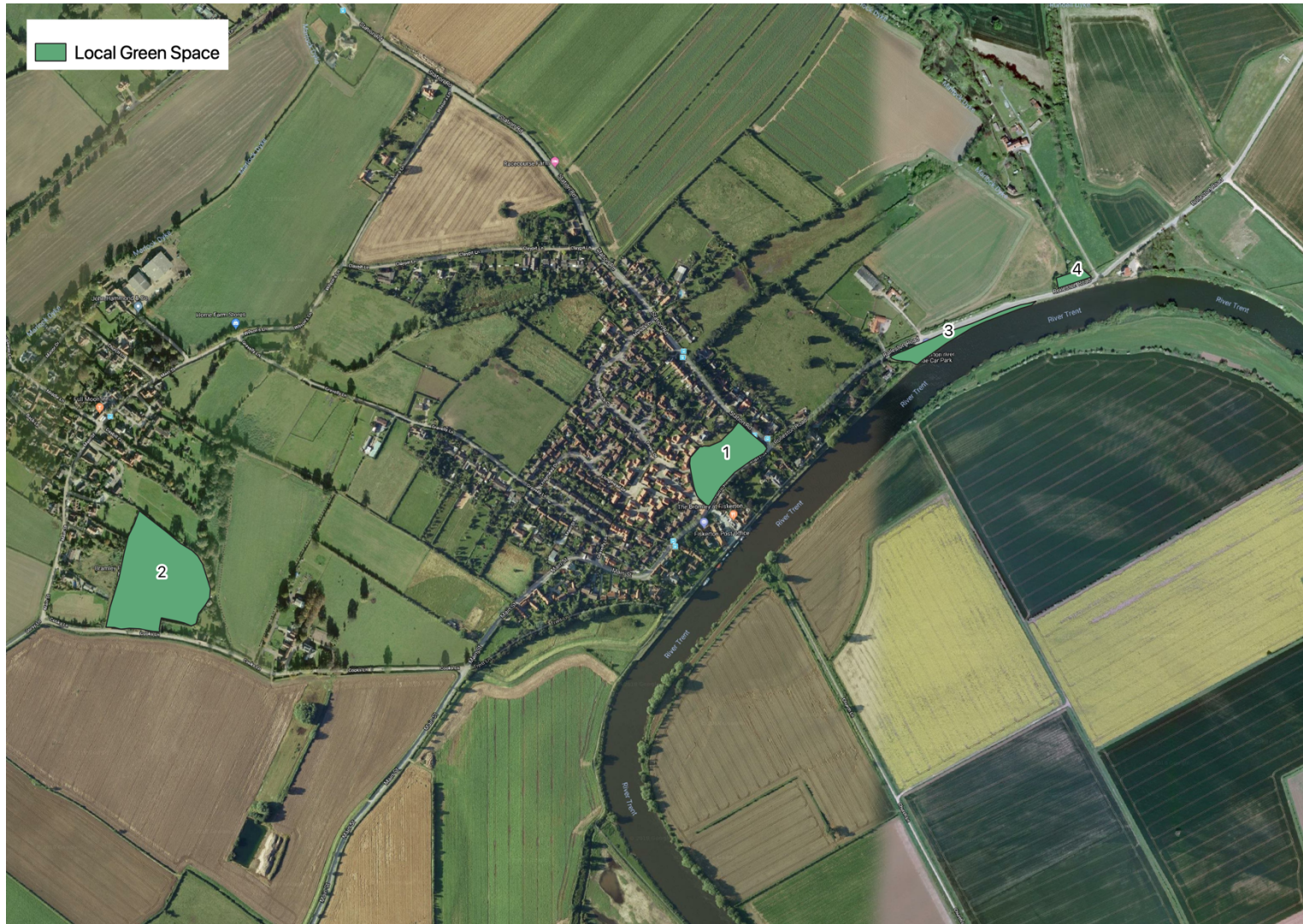
Figure 13 Local Green Space Map