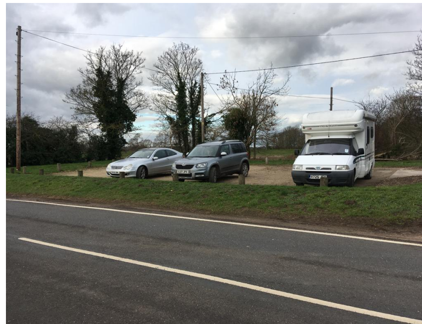
Figure 11 Fishermen's Car Park Local Green Space view from (2)