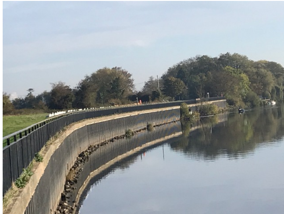
Figure 8 Riverside Car Park and Picnic area