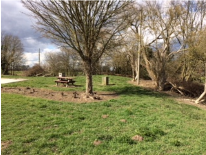
Figure 6 Riverside Car Park and Picnic area