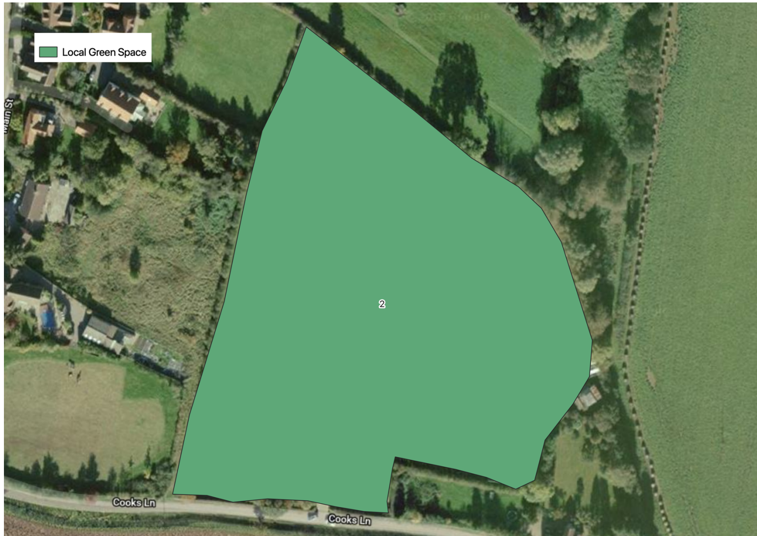
Figure 5 Arthur Radford Map