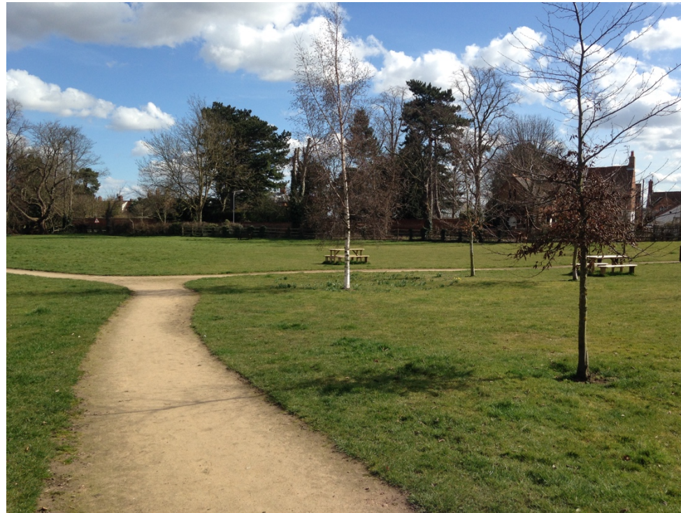
Figure 1 Village Green