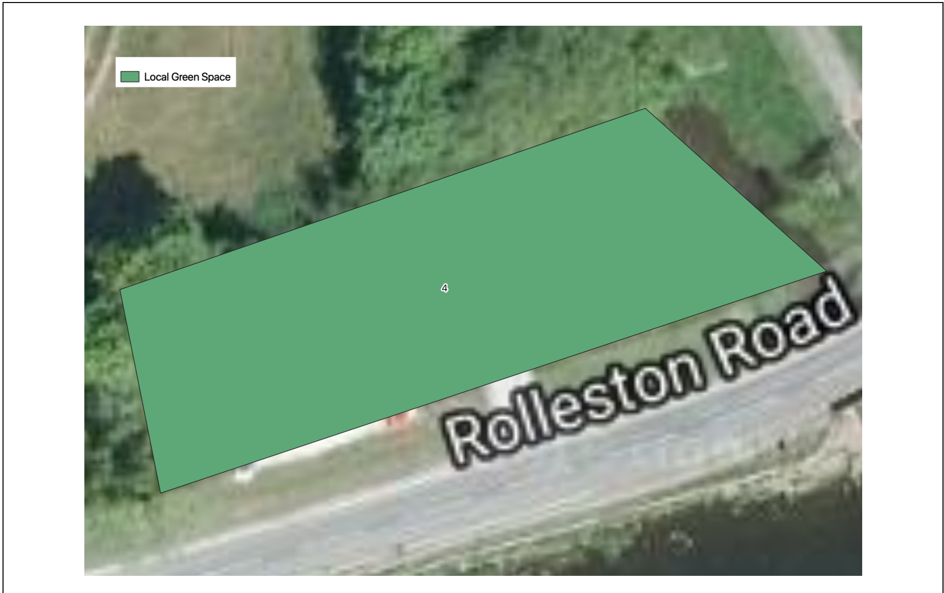
Figure 12 Fishermen's Car Park and Picnic Area Map