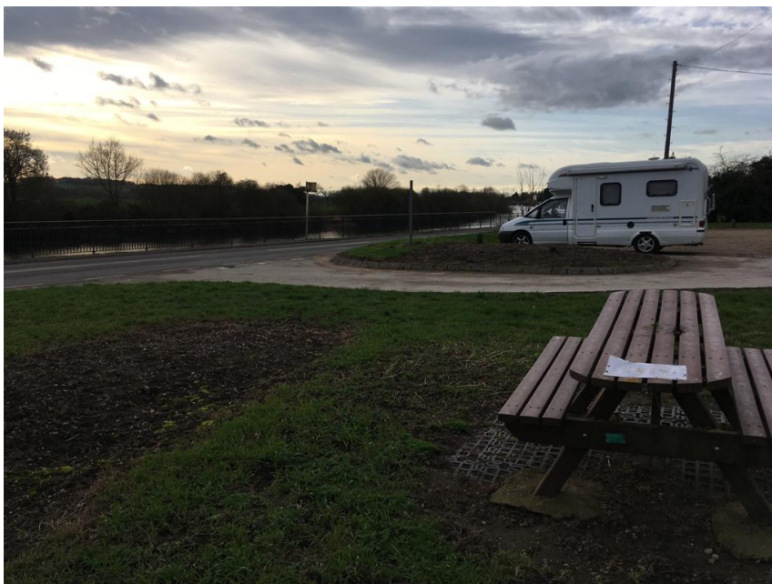
Figure 10 Fishermen's Car Park Local Green Space view from (1)