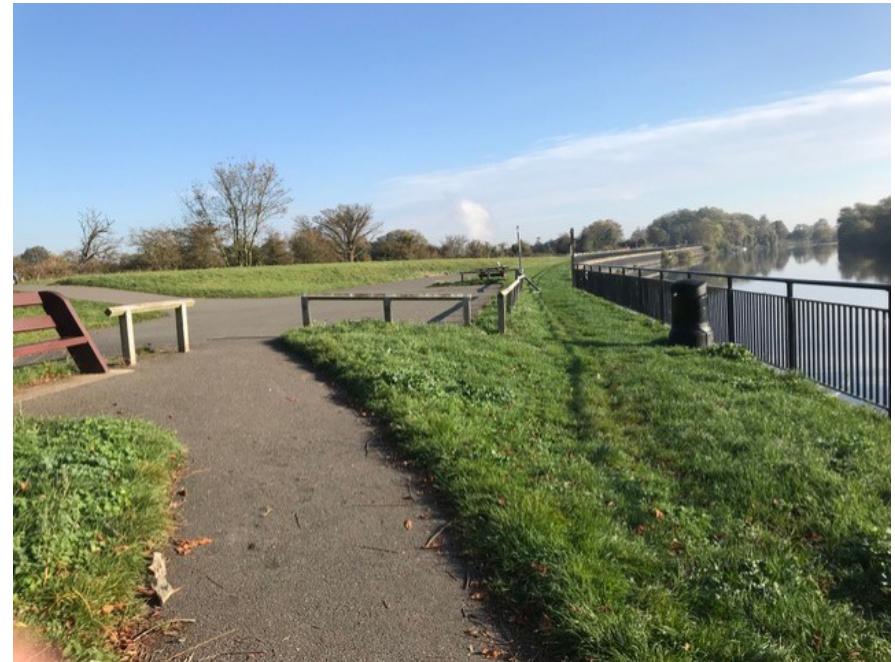
Figure 7 Riverside Car Park and Picnic area