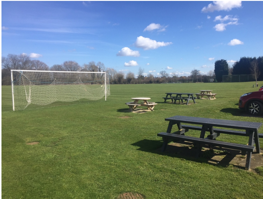
Figure 3 Arthur Radford Sports Ground