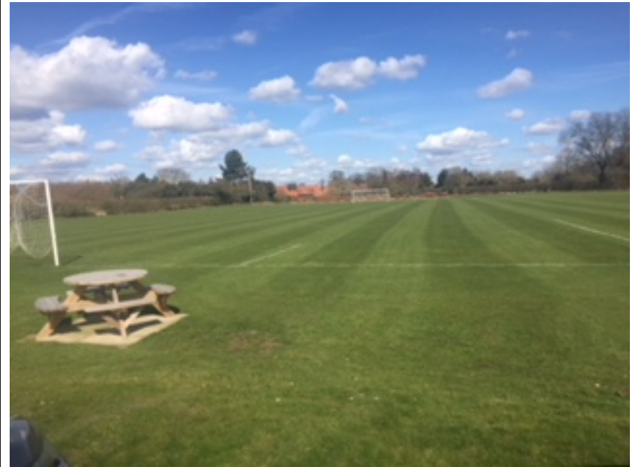
Figure 4 Arthur Radford Sports Ground