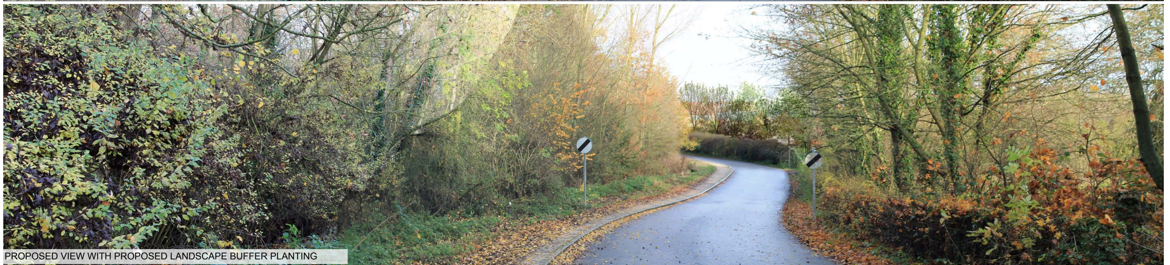
PROPOSED VIEW WITH PROPOSED LANDSCAPE BUFFER PLANTING

NOTE: The photographs within this sheet have been scaled to match the equivalent view of the human eye, when printed out at A2 and viewed at a distance of 300mm. However, for the purpose of this assessment, due to print quality formatting procedures within the document, the photographs have been reduced to fit onto an A3 sheet and should, therefore, be viewed at an approximate distance of 200mm. Copies of the photographic views at A2 can be obtained from Influence-cla.