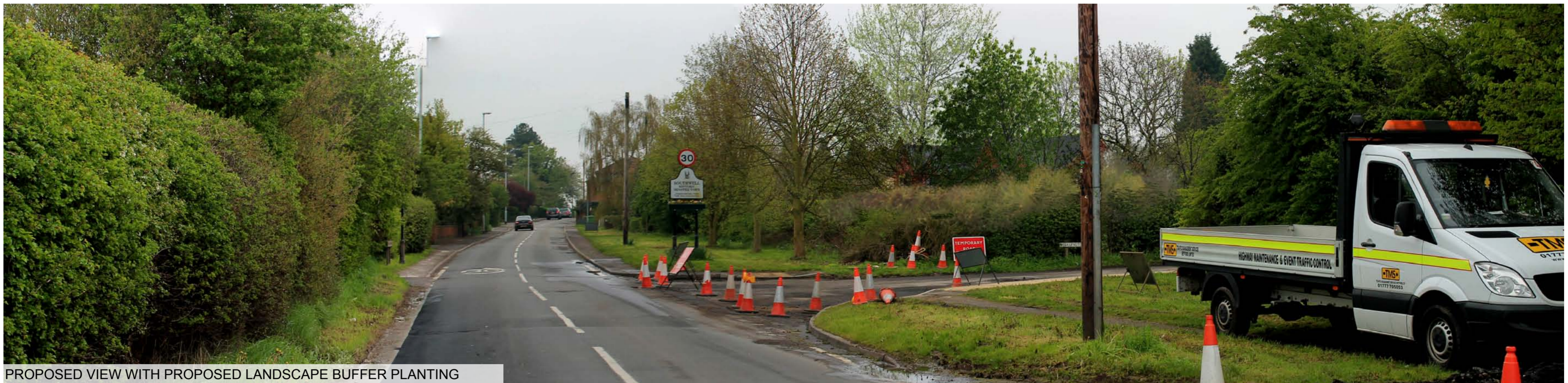
PROPOSED VIEW WITH PROPOSED LANDSCAPE BUFFER PLANTING

NOTE: The photographs within this sheet have been scaled to match the equivalent view of the human eye, when printed out at A2 and viewed at a distance of 300mm. However, for the purpose of this assessment, due to print quality formatting procedures within the document, the photographs have been reduced to fit onto an A3 sheet and should, therefore, be viewed at an approximate distance of 200mm. Copies of the photographic views at A2 can be obtained from Influence-cla.