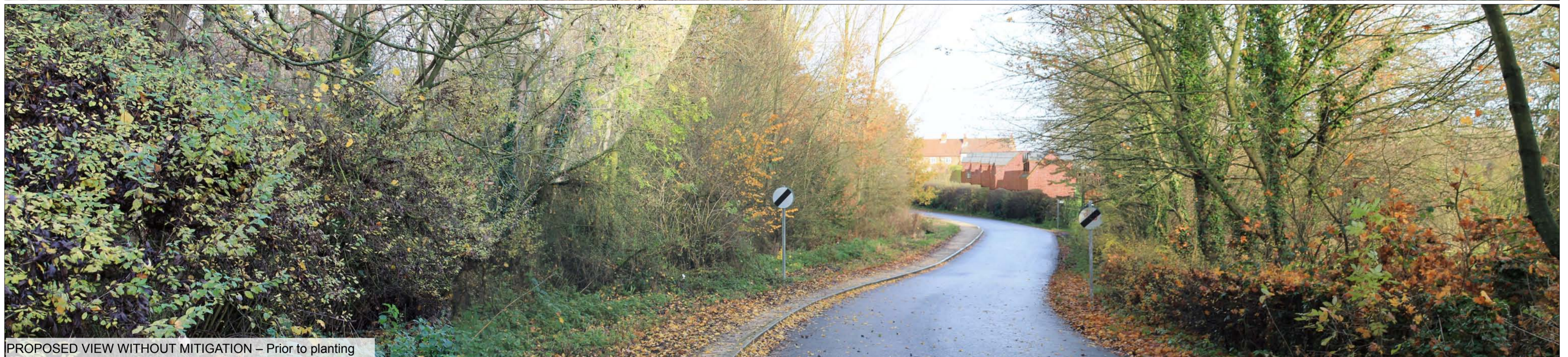
PROPOSED VIEW WITHOUT MITIGATION – Prior to planting