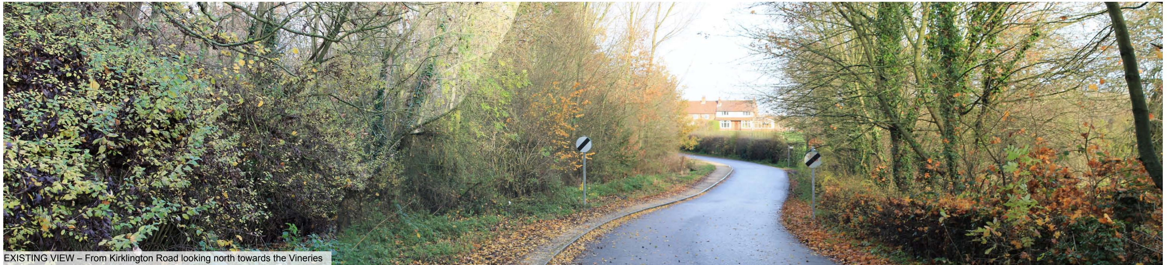
EXISTING VIEW – From Kirklington Road looking north towards the Vineries