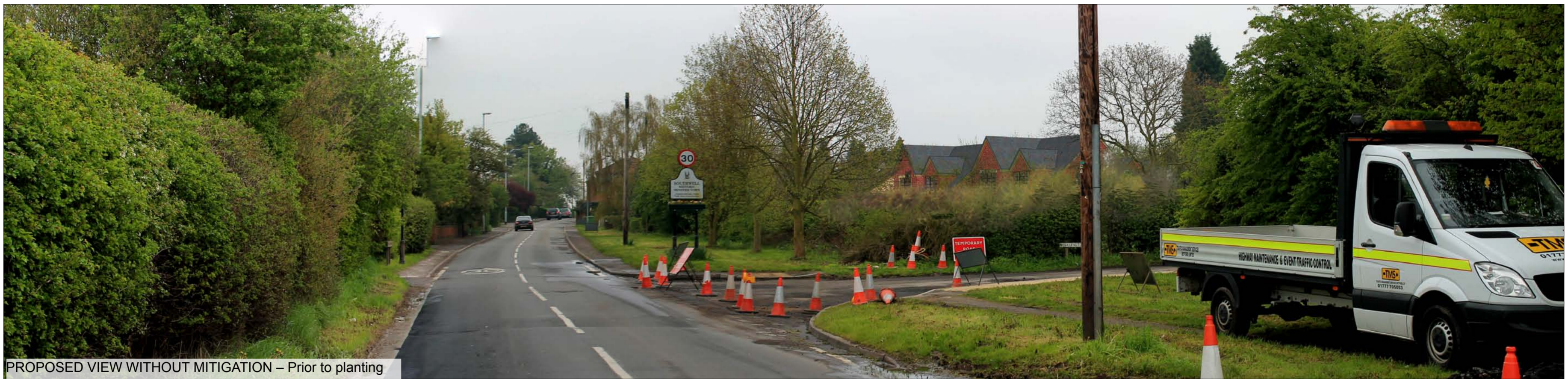
PROPOSED VIEW WITHOUT MITIGATION – Prior to planting