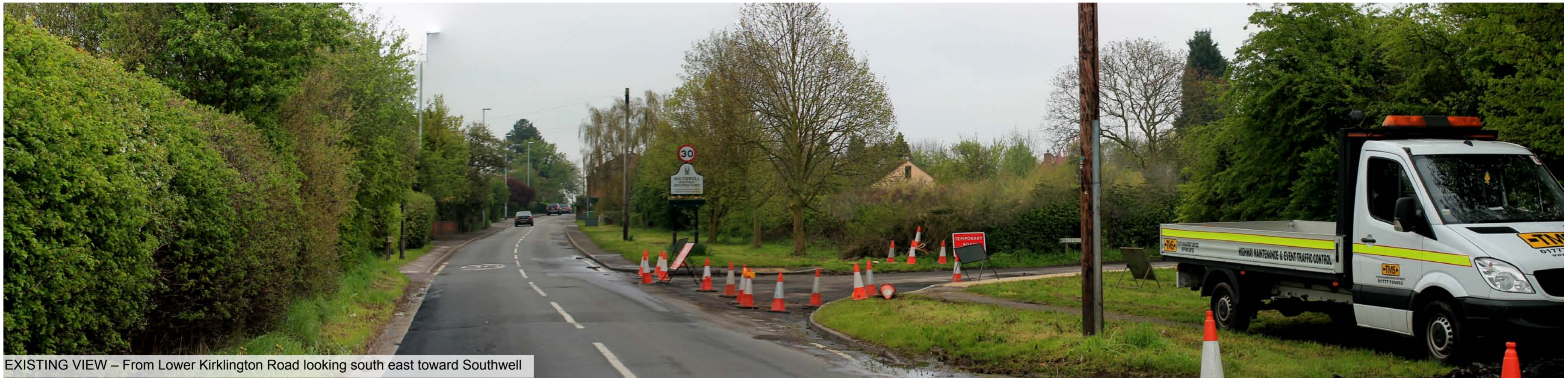
EXISTING VIEW – From Lower Kirklington Road looking south east toward Southwell